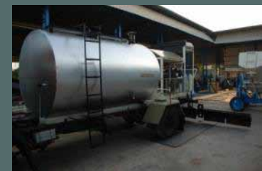
TOP ACCESS LADDER

A ladder and platform is provided for ease of access to the top. A cock is given so that full bitumen tank can be drained out when required.