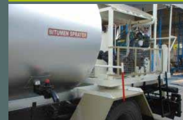
BITUMEN DRAIN OUT COCK