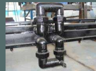
SPRAY BAR BEND